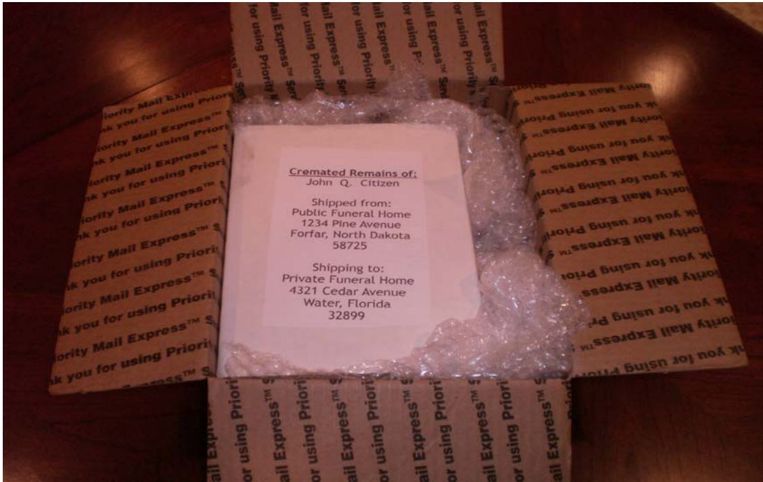
Inside Postal Supplied Box